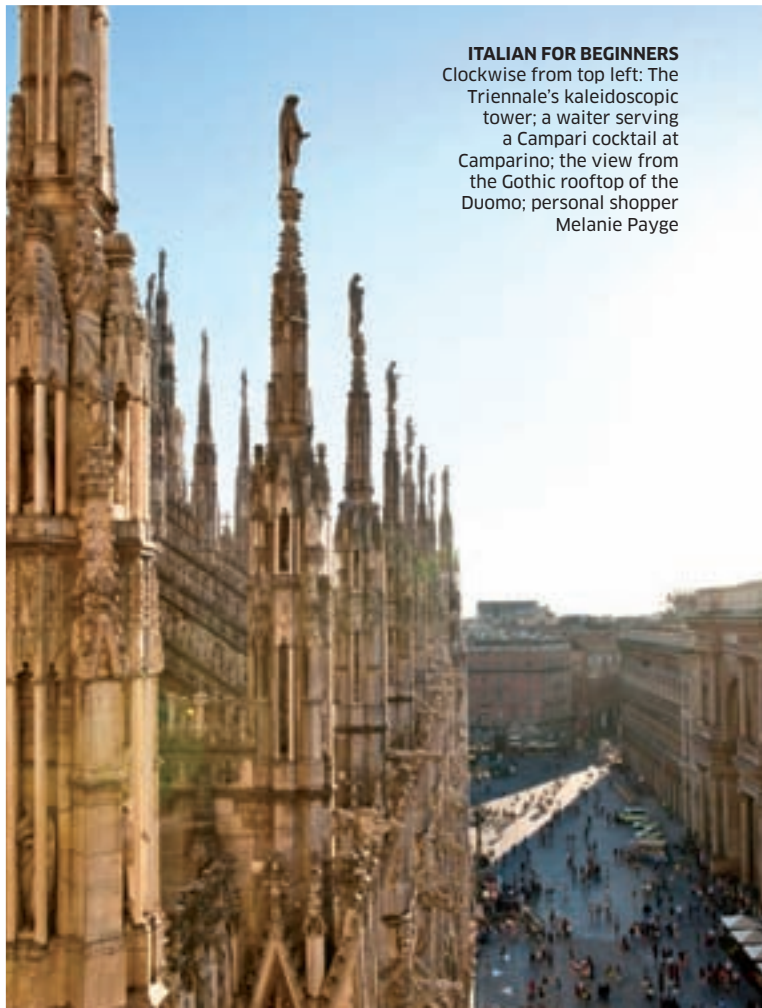
ITALIAN FOR BEGINNERS Clockwise from top left: The Triennale's kaleidoscopic tower; a waiter serving a Campari cocktail at Camparino; the view from the Gothic rooftop of the Duomo; personal shopper Melanie Payge